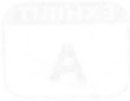
EXHIBIT 'A' LEGAL DESCRIPTION

Part of the Northwest Quarter of the Northwest Quarter of Section 1 in Township 17 North of Range 34 West, Washington County, Kansas, more particularly described as follows: Commencing at the Northwest corner of the Northwest Quarter of the Northwest Quarter of the said Section 1, and running thence S88° 15' 23" E 55.50 feet and S88° 15' 23" E 1607.50 feet to the true point of beginning, and thence S88° 15' 23" E 571.23 feet, thence S03° 10' 31" W 482.88 feet, thence S23° 05' 18" W 171.23 feet, thence N03° 10' 31" E 461.46 feet to the point of beginning, containing 2.98 acres, more or less.