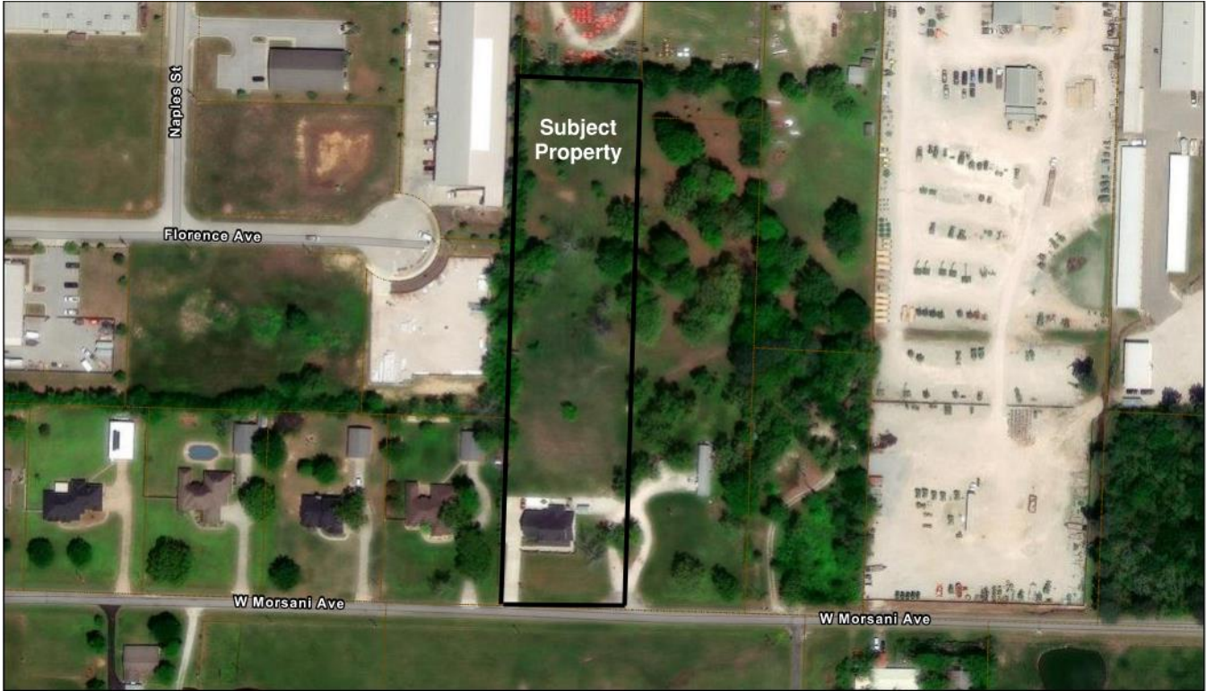
Figure 1: Vicinity Map