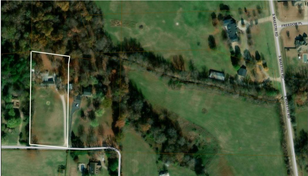
Figure 1: Vicinity Map